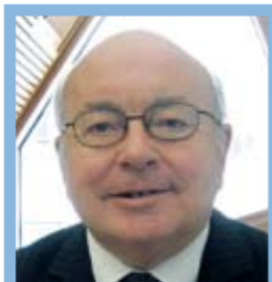
Bill Aitken MSP Scottish Shadow Cabinet Secretary for Justice and Convener of the Parliamentary Justice Committee.

This conference will examine the steps being taken by Scotland's justice agencies to modernise ICT systems and aid the justice process. What are the systems currently in place, the plans and opportunities for future roll out and the interaction between key players in both the public and private sectors? Issues surrounding security and implementation will be debated, areas of best practice will be highlighted and the areas where major gains can be made discussed.