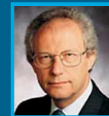
The Rt. Hon. Henry McLeish, Chair, Scottish Prisons Commission