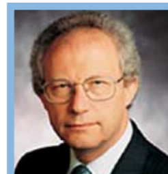
The Rt. Hon. Henry McLeish, Chair, Scottish Prisons Commission