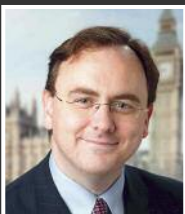
David Cairns MP Minister of State, Scotland Office KEYNOTE SPEAKER